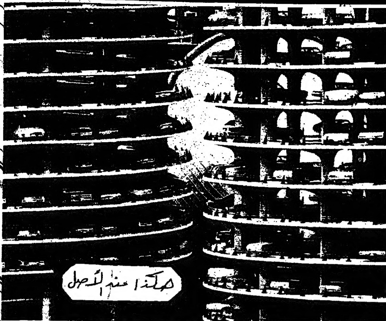
Chicago has attempted to solve the parking problem by building multi-floor garages. (Rubinger)